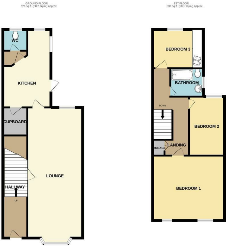
9 DALE AVENUE, LONG EATON TOTAL FLOOR AREA: 1165 sq ft. (108.2 sq.m.) approx. Whilst every attempt has been made to ensure the accuracy of the floorplan contained herein, measurements of doors, windows, rooms and any other items are approximate and no responsibility is taken for any error, omission or misstatement. This plan is for illustrative purposes only and should be used as such by any prospective purchaser. The services, systems and appliances shown have not been tested and no guarantee as to their operability or efficiency can be given. Made with Metropix (2022)